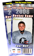
2 GAME Tickets