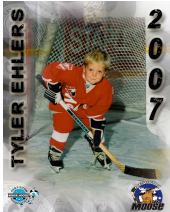
Trading Cards (6)

Select from the following "extra" package options and return on photo night with payment.