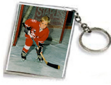
2" x 3" Key Tag