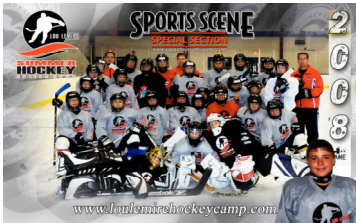
12" x 18" Poster